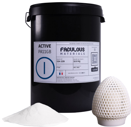
PA11 Glass Beads